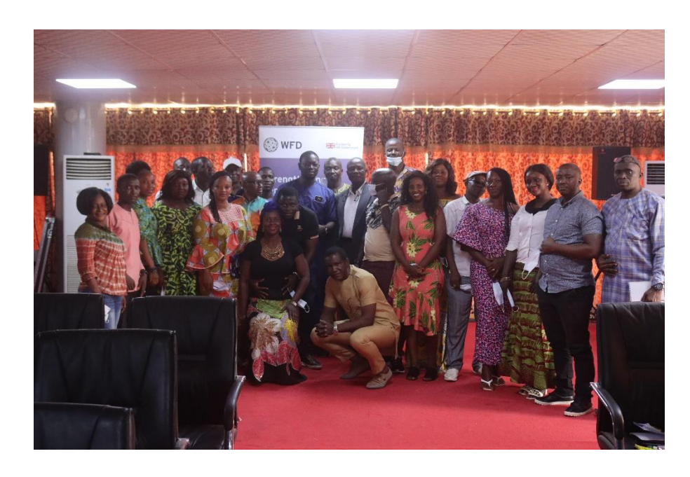
Participants at the digital data collection training

Setting up a data management system to analyse and support citizens accessibility in Parliament